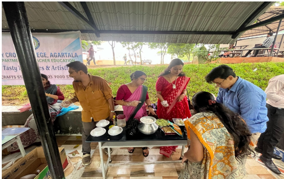
Approximately 2 handicraft

Event started as per the scheduled time i.e. 10:00 AM. All started with an entrepreneurship education program conducted by the department of BBA, HCC. They hosted a quiz competition event for the students. Three students of the Department of Teacher Education have won the quiz prizes. On the other side, exhibition participants started installing their food & craft stalls.