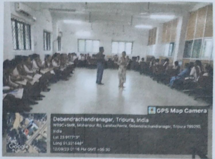
Induction session to Library