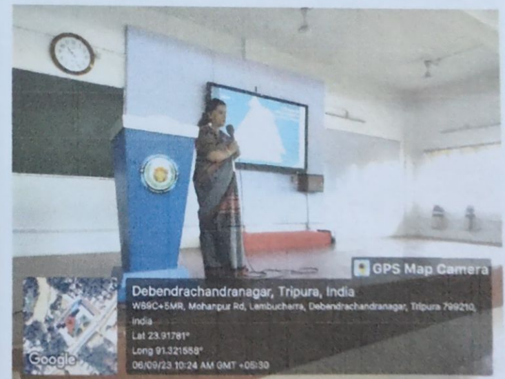
NEP-2020 introductory session