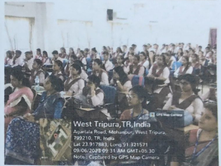
Glimpses of inaugural session