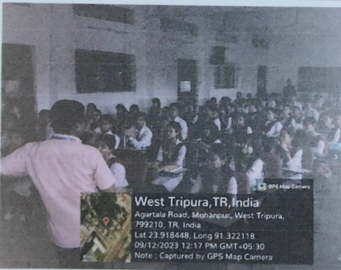
Orientation session conducted by Department of Botany

GPS Map Camera West Tripura, TR, India Agartala Road, Mohanpur, West Tripura, 799210, TR, India Lat 23.918448, Long 91.322118 09/12/2023 12:17 PM GMT+05:30 Note : Captured by GPS Map Camera