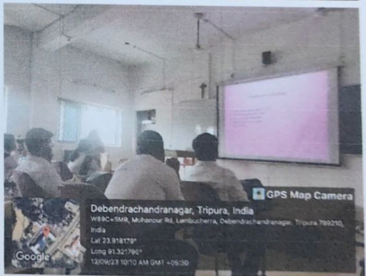
Orientation session conducted by Department of Zoology