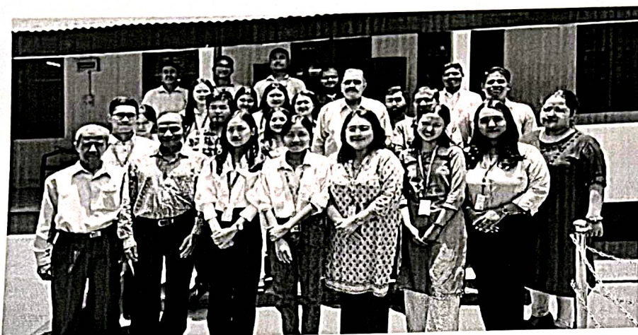
Students selected for Internship in Tripura Human Rights Commission 2023