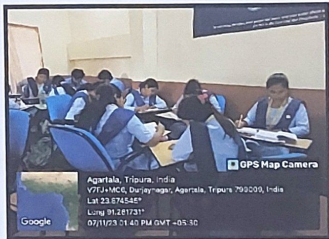
PIC : B.Ed, 1 st Semester 2023.