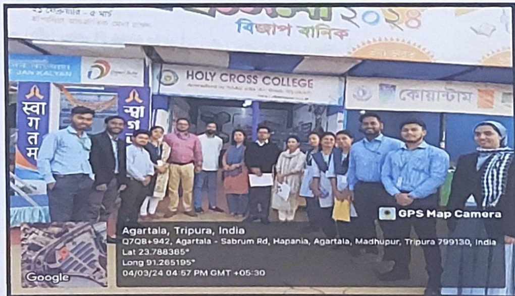
Activity : Book Fair, Stall duty with B.Ed, 3 rd Semester Students 2024